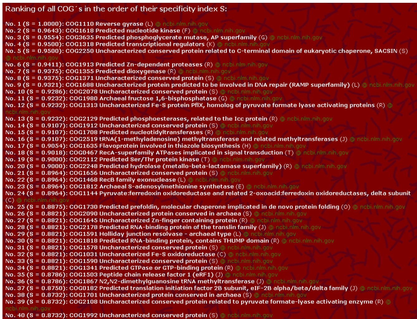
Figure 3 Partial screenshot of the COG-ranking

interactions could be detected in silico, and this tool is also suitable to assign proteins of unknown function to partially known biochemical pathways. A further application lies in the search of alternate enzymes originated by convergent evolution.